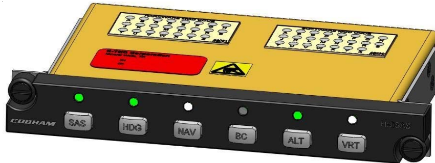
Figure 5-1. HeliSAS Control Panel (HCP)

Autopilot modes are selected on the HeliSAS Control Panel in Figure 5-1.