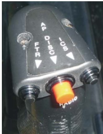
Figure 1-1. Cyclic Buttons

The cyclic-mounted force trim release (FTR) and AP DISC buttons as installed on a Bell 206B cyclic is shown in Figure 1-1.